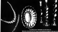
"LA CRUCIA LINE" STERLING SILVER (925) / MEXICAN PETER PLATTER AND CHANDELIER (925) / MEXICO CITY